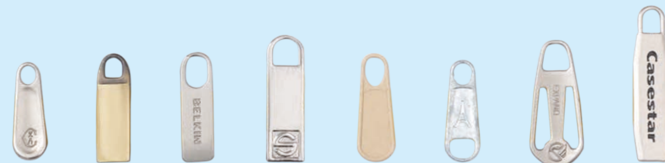
BLT-375 BLT-376 BLT-377 BLT-378 BLT-379 BLT-380 BLT-381 BLT-382