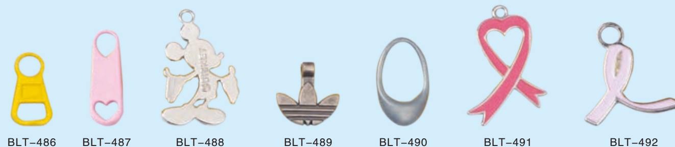
BLT-486 BLT-487 BLT-488 BLT-489 BLT-490 BLT-491 BLT-492