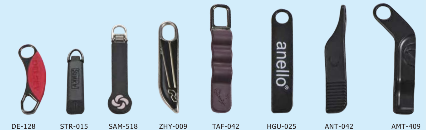
DE-128 STR-015 SAM-518 ZHY-009 TAF-042 HGU-025 ANT-042 AMT-409