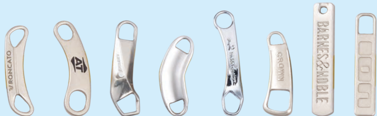
BLT-360 BLT-361 BLT-362 BLT-363 BLT-364 BLT-365 BLT-366 BLT-367