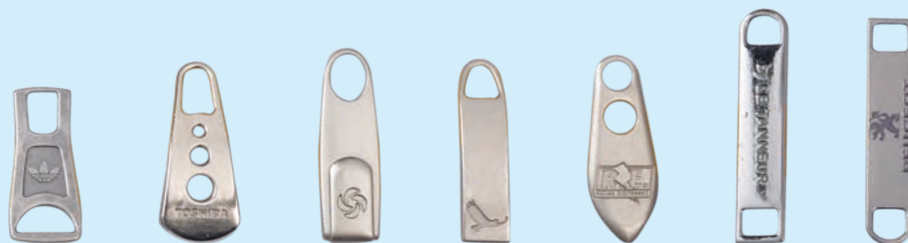
BLT-353 BLT-354 BLT-355 BLT-356 BLT-357 BLT-358 BLT-359