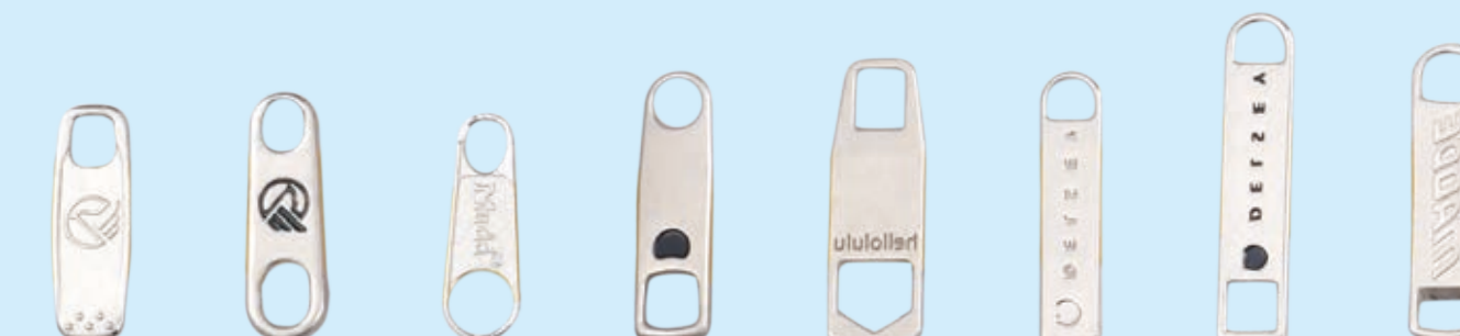
BLT-383 BLT-384 BLT-385 BLT-386 BLT-387 BLT-388 BLT-389 BLT-390