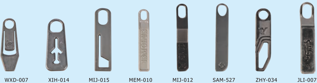
WXD-007 XIH-014 MIJ-015 MEM-010 MIJ-012 SAM-527 ZHY-034 JLI-007