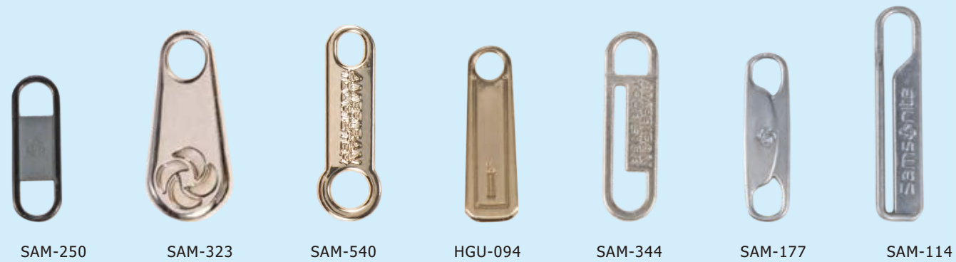
SAM-250 SAM-323 SAM-540 HGU-094 SAM-344 SAM-177 SAM-114