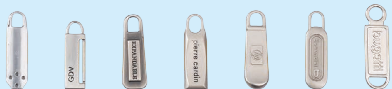
BLT-346 BLT-347 BLT-348 BLT-349 BLT-350 BLT-351 BLT-352