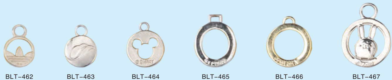
BLT-462 BLT-463 BLT-464 BLT-465 BLT-466 BLT-467