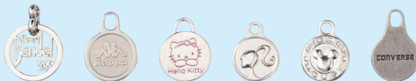
BLT-468 BLT-469 BLT-470 BLT-471 BLT-472 BLT-473