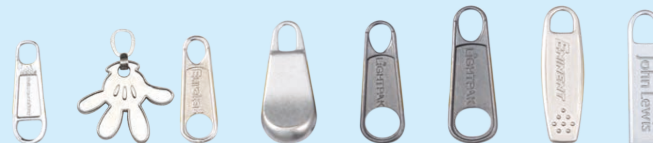
BLT-391 BLT-392 BLT-393 BLT-394 BLT-395 BLT-396 BLT-397 BLT-398