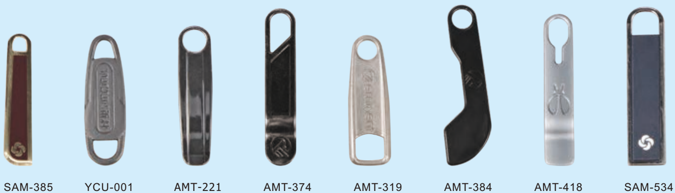
SAM-385 YCU-001 AMT-221 AMT-374 AMT-319 AMT-384 AMT-418 SAM-534