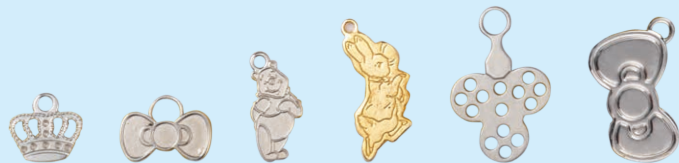
BLT-480 BLT-481 BLT-482 BLT-483 BLT-484 BLT-485