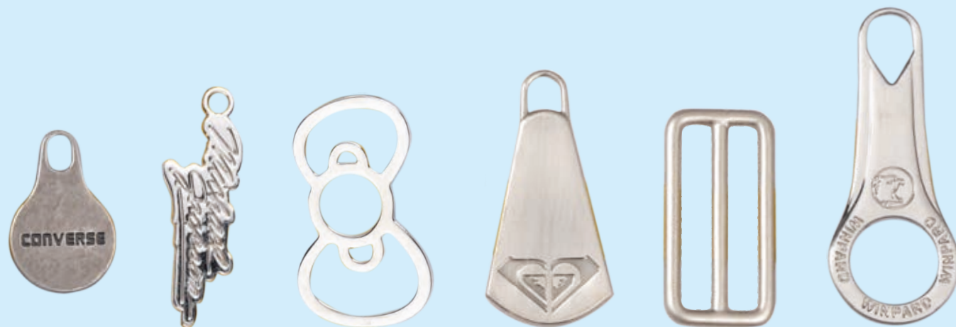
BLT-503 BLT-504 BLT-505 BLT-506 BLT-507 BLT-508