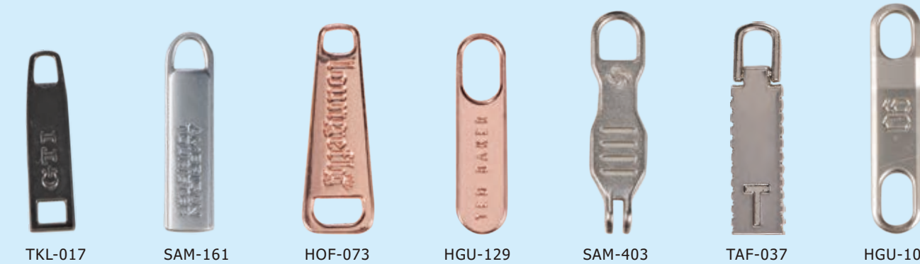
TKL-017 SAM-161 HOF-073 HGU-129 SAM-403 TAF-037 HGU-101