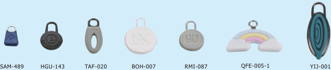
SAM-489 HGU-143 TAF-020 BOH-007 RMI-087 QFE-005-1 YIJ-001