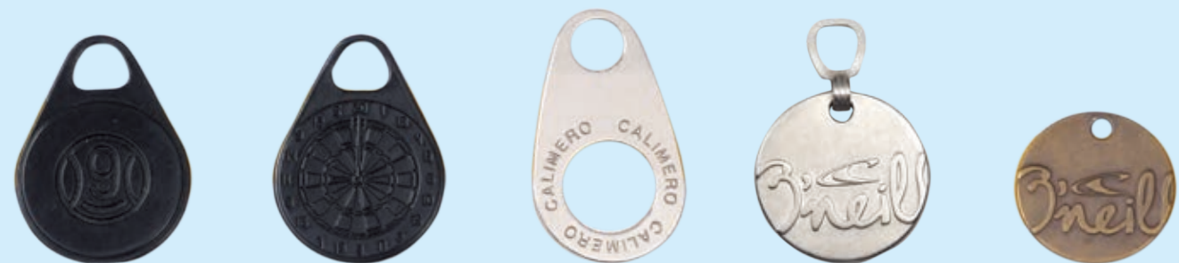
BLT-493 BLT-494 BLT-495 BLT-496 BLT-497