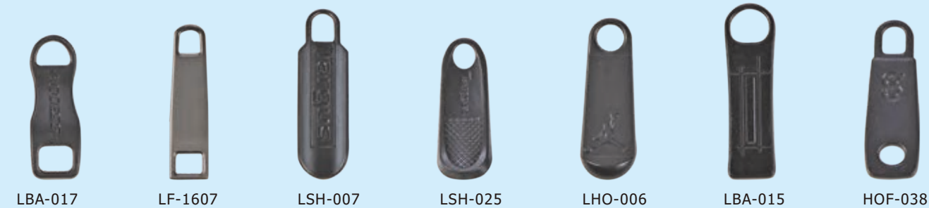
LBA-017 LF-1607 LSH-007 LSH-025 LHO-006 LBA-015 HOF-038