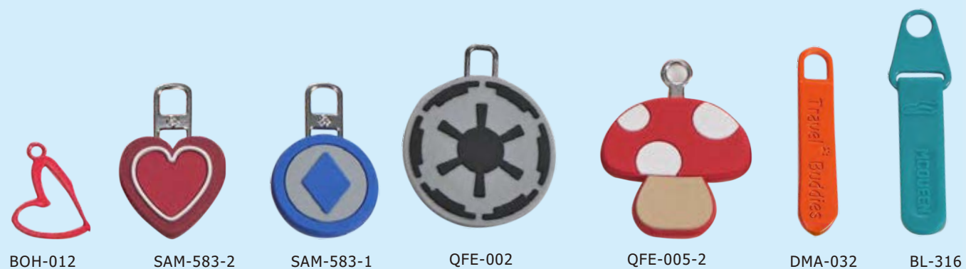
BOH-012 SAM-583-2 SAM-583-1 QFE-002 QFE-005-2 DMA-032 BL-316