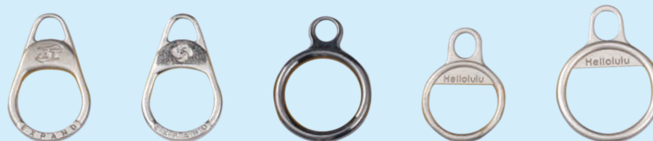
BLT-498 BLT-499 BLT-500 BLT-501 BLT-502