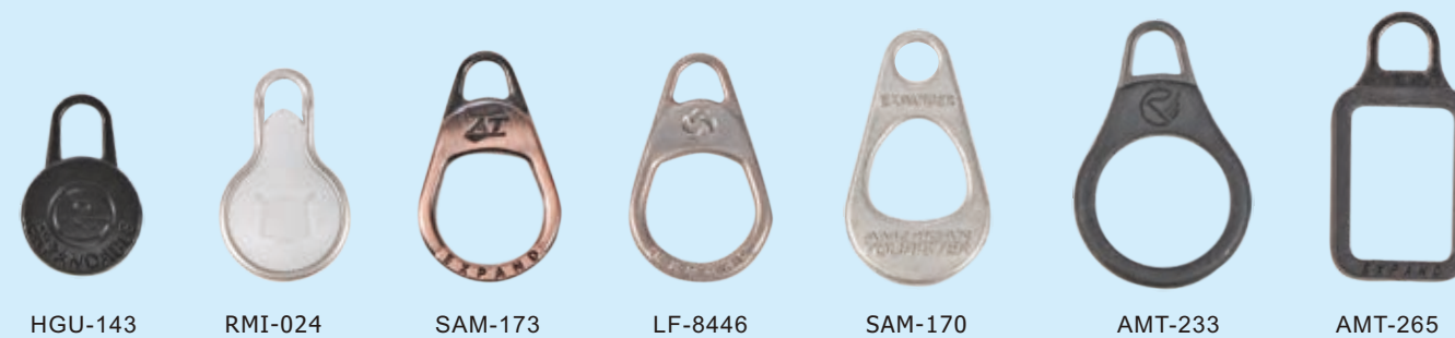
HGU-143 RMI-024 SAM-173 LF-8446 SAM-170 AMT-233 AMT-265