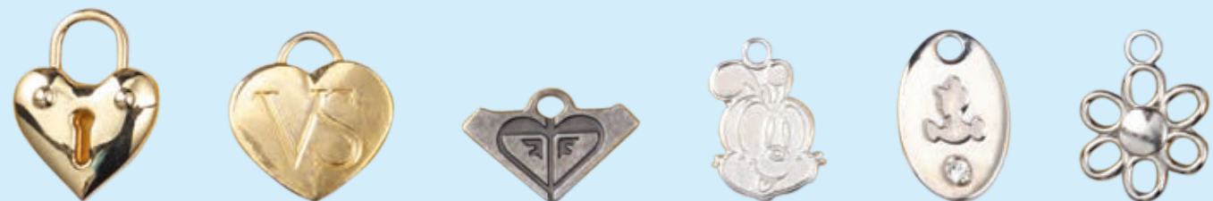
BLT-474 BLT-475 BLT-476 BLT-477 BLT-478 BLT-479