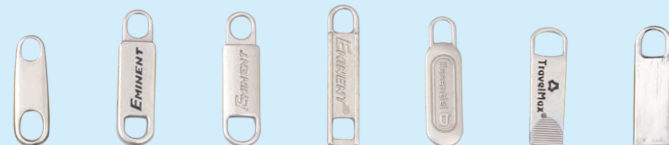
BLT-368 BLT-369 BLT-370 BLT-371 BLT-372 BLT-373 BLT-374