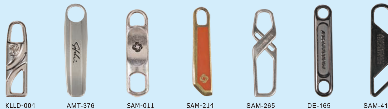
KLLD-004 AMT-376 SAM-011 SAM-214 SAM-265 DE-165 SAM-417