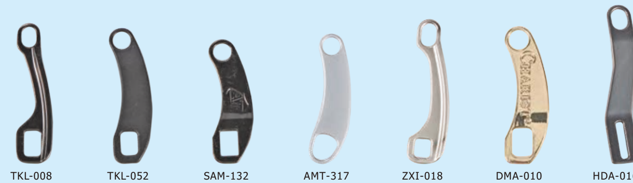
TKL-008 TKL-052 SAM-132 AMT-317 ZXI-018 DMA-010 HDA-016