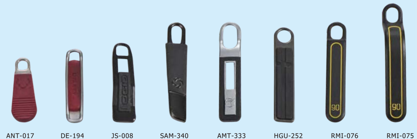
ANT-017 DE-194 JS-008 SAM-340 AMT-333 HGU-252 RMI-076 RMI-075